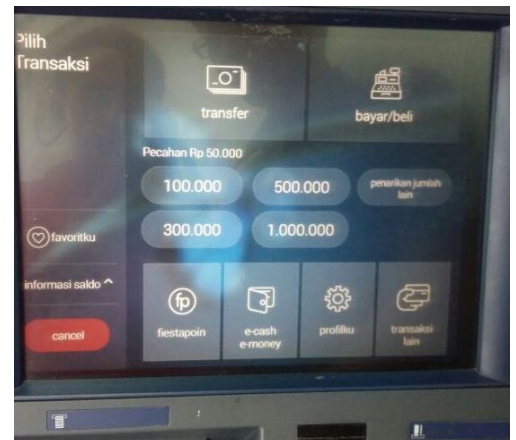
Mandiri ATM with old system